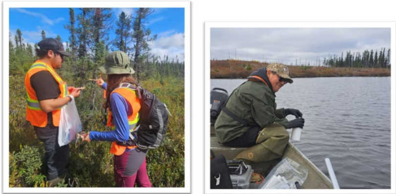
Field technicians undertaking vegetation studies and water quality sampling 2024, Shaakichiuwaanaan Project.