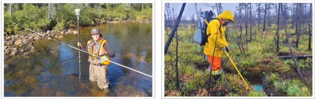
Field technicians undertaking hydrology and fisheries works, 2024, Shaakichiuwaanaan Project.