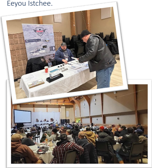
Booth and presentation, Chisasibi's Symposium, March 2025

Patriot presented a bilingual Shaakichiuwaanaan Project update at Chisasibi's First Mining and Economic Development Symposium. We also participated in a panel about the Benefits and Challenges of Mining in Eeyou Istchee.