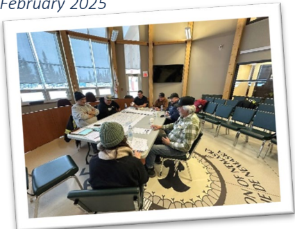
Meeting with M02A land users, Nemaska, February 2025