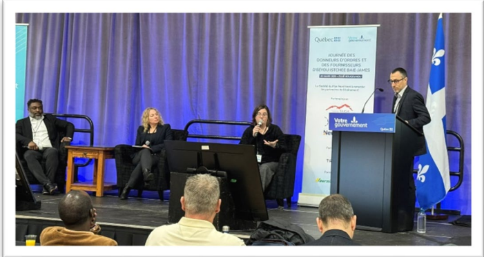
Participation in a panel, Ouje-Bougoumou, March 2025

Patriot met local entrepreneurs in Ouje-Bougoumou at the 7 th Contractor / Supplier Day organized by the Société du Plan Nord. We also participated in a panel under the theme: Eeyou Istchee Baie-James, a land of opportunity.