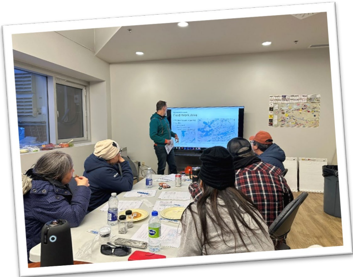
Discussion around fish habitat and compensation projects with our consultant Niigaan/Synergis, Patriot’s Chisasibi Office, March 2025